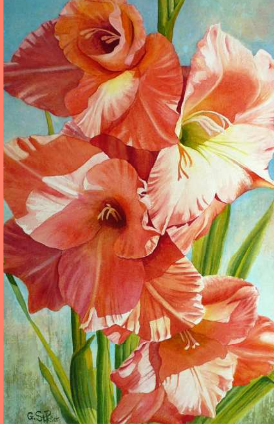
“Mom’s Glad” By Gail St. Peter

July 18 - 19 - 20, 2008 10 am to 5 pm Sequim, Washington