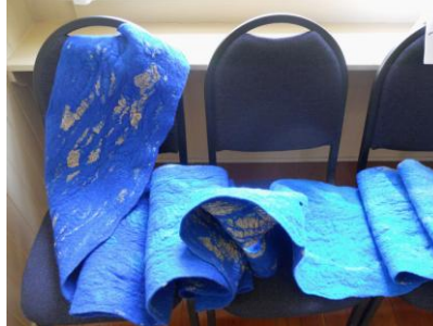
36 Foot long panel