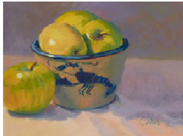
Blue Lobster Golden Delicious