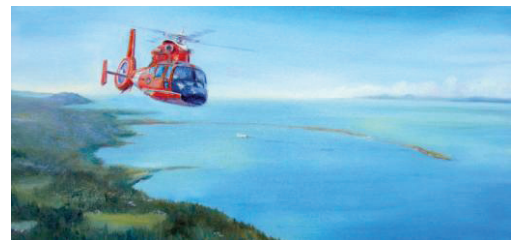
H65 over PA