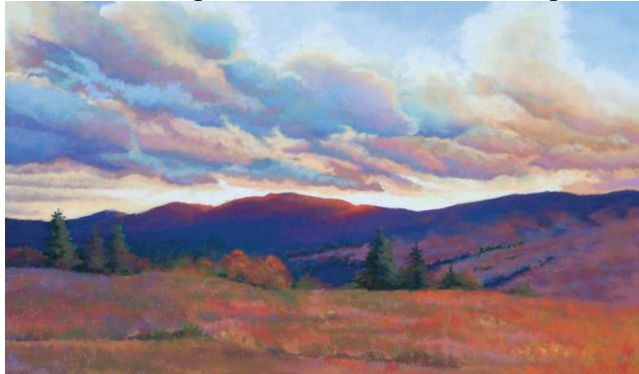
Romancing the clouds in Eastern Oregon