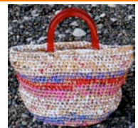
Market Bag made from used plastic bags

INSPIRATION COMES TO US IN SO MANY WAYS; WHETHER TRAVELING TO EXOTIC LANDS, STROLLING DOWN COUNTRY ROADS, WALKING THROUGH URBAN SETTINGS OR JUST SITTING STILL AND SIMPLY OPENING OUR EYES. WE ARE SURROUNDED BY AN ENDLESS FLOW OF IDEAS. HAVING THE ABILITY TO FIND INSPIRATION IN THE SIMPLEST OF FORMS, THE FAMILIAR, AND THE EVERYDAY IS A TREMENDOUS GIFT. IN THIS PRESENTATION, I WILL LET MY IMAGES BE MY WORDS. SHARING A GLIMPSE OF HOW I, AS AN ARTIST, SEE THE WORLD.